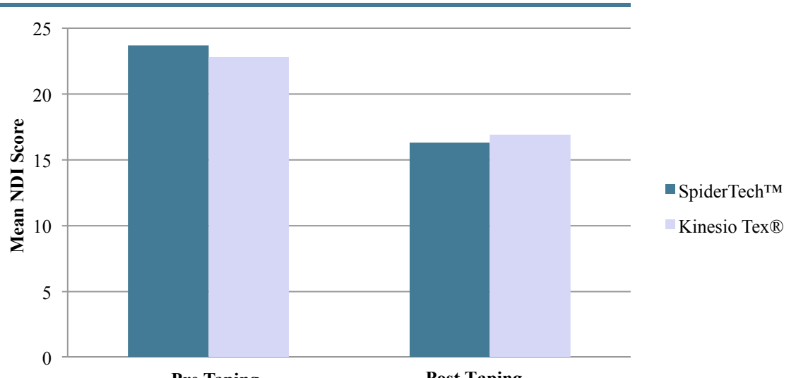
Figure 5. Pre- and post- pain scores using the Neck Disability Index, time by group